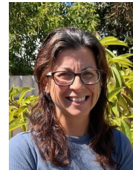
Karen Needham Pre Primary

FACTION HATS Wedgie Boutique is excited to launch our reversible FACTION HATS! School coloured on one side for everyday wear, and turn inside out to reveal your Faction Colour!